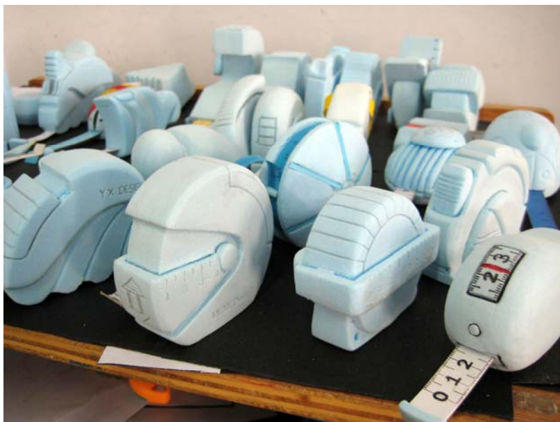
Figure 7: Conclusion: Tape Measure Project - evidence that words are not needed to teach design (R. Firth 2009)

It is fitting for us to conclude this paper with an image (fig 7).