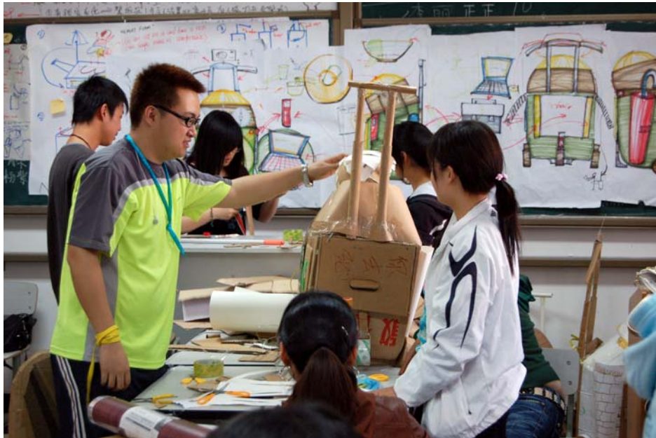
Figure 2: ZZULI design students working at full scale (I. Lambert 2008)

(see fig. 2). However, it was difficult to get them to value a strong concept over what “looked good” which is what they had been trained to do.