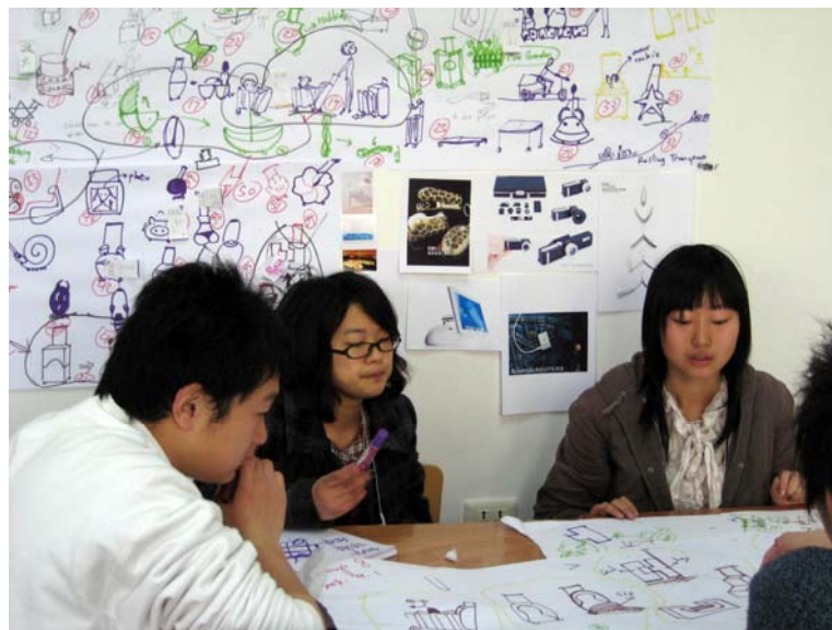
Figure 1: ZZULI design students brainstorm ideas as a group (R. Firth 2008)

With the students unaccustomed to this form of learning, we used Tom Kelley’s guide to the Perfect Brainstorm (Kelley, 2002), to carefully explain the “rules” of brainstorming.