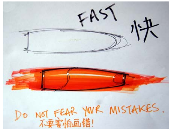
Figure 3: Demonstration sketch of a highlighter pen for students (I. Lambert 2009)

Removing the need for a translator in the studio resulted in a stronger teacher-learner relationship in both an individual and group context. When a task needed to be carried out, we tried to explain it with images. At times, a kind of design Pictionary ® was used. Figure 4 shows how we tried to explain that we wanted five pages of developmental sketching. The group showed a certain degree of delight as we addressed the room with drawing.